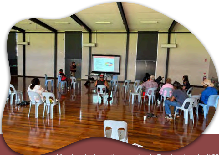
Members' information meeting in Paraburdoo, April 2024