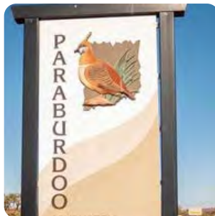
Dates inside for member services team visits to Karratha, Port Hedland, Bellary Springs and Wakuthuni