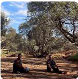
Meet our new ranger coordinator