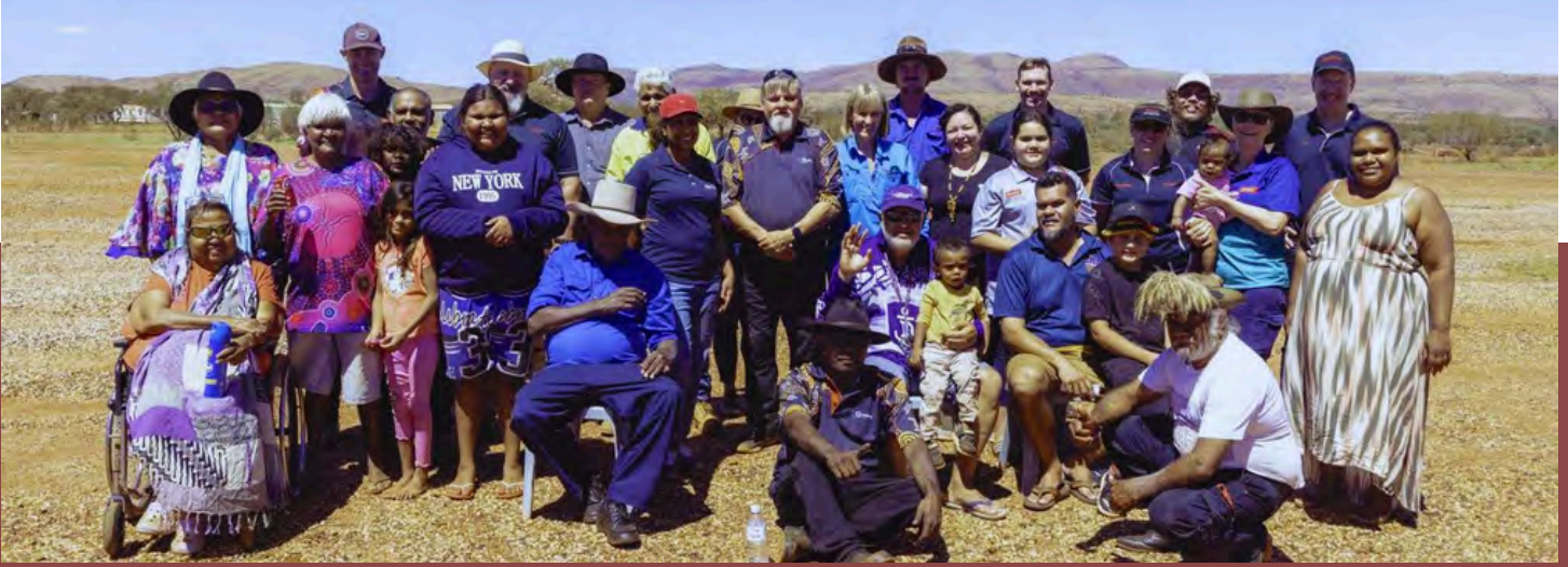
Photo from Living Cultures launch in March 2024.