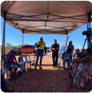
Living Cultures project gets underway