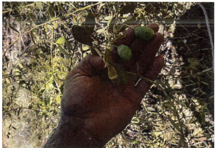
Identifying bush tucker and bush medicines are just some of the skills that the Yinhawangka Rangers are learning. Pictured above is a native passionfruit.