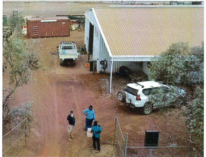
A drone view of Yinhawangka Rangers HQ on Camp Road, Paraburdoo.

The corporation has purchased two new drones for the rangers to take footage and photos out on country. We look forward to sharing some of these with the community as more spectacular scenery is captured in 2020.